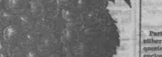
Choice Nursery Stock

'Doctor,' said an old lady the other day to her family physician. 'Kiss you tell me how it is that some folks are born dumb?' 'Why, hem, certainly dumb,' replied the doctor; 'It is owing to the fact that they came into the world without the power of speech.'