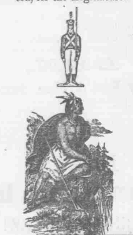
Morton's Buffalo county constitu-