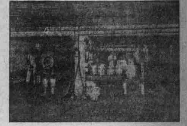
Das Werk der Creamery-Butter in täglich 100,000 Pfund haltende Maschinen-Triebe.