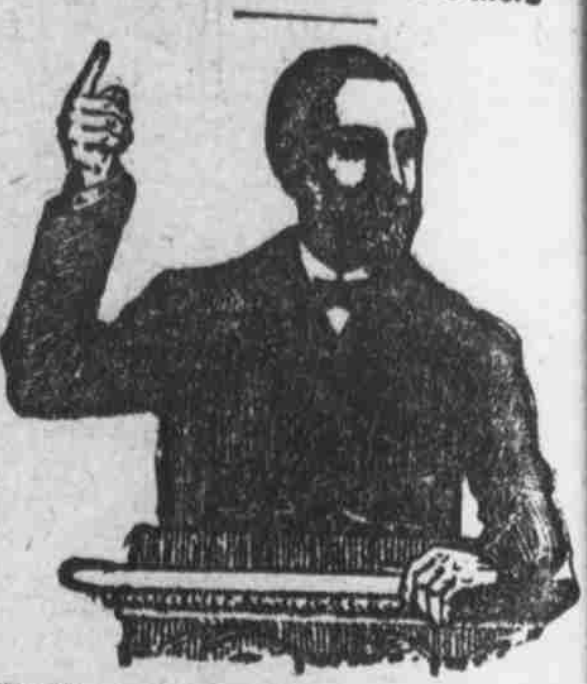
"Don't Believe That Old Humbug About 'Urle Acid' Being the Cause of Bheumatism - It's Net So!"

Suffered Tortures For Years-Nov Telling Good News To Others