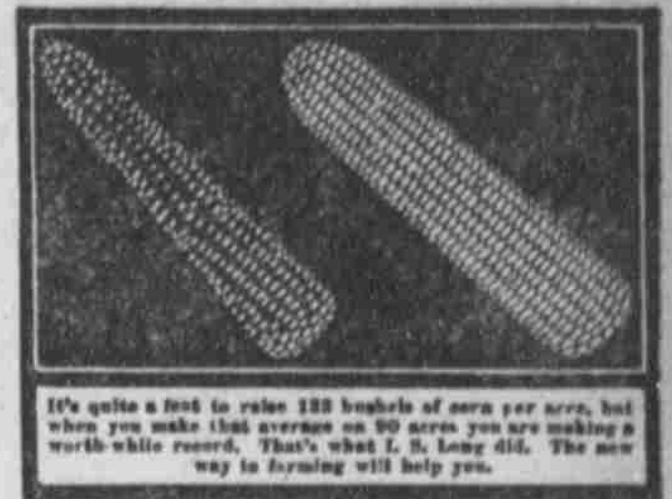
It's quite a feat to raise 125 bushels of corn per acre, but when you make that average on 90 acres you are making a worth-while record. That's what L. S. Long did. The new way in farming will help you.