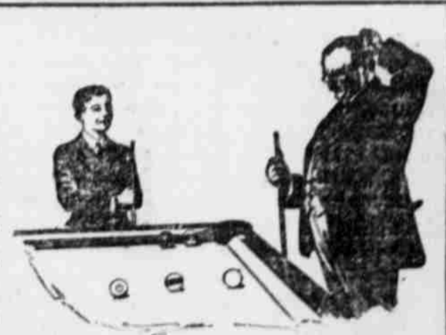
that they themselves can hardly wait each day for the "Billiard Hour,"

Parents who secured home tables for their young folks write us