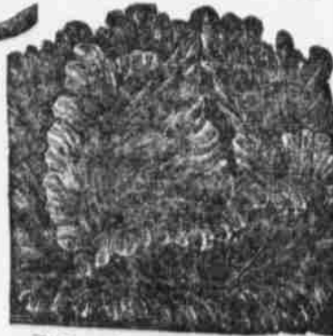
60 Day Cabbage Quickering cabbage in the world. Heads