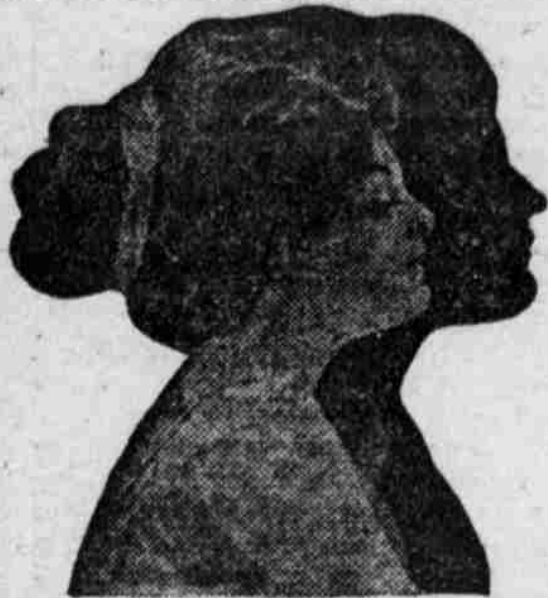
"I Got Rid of My Pimples in a Few Days With Stuart's Calcium Wafers."

Trial Package Sent Free to Prove It. You don't want to wait forever and a day to get rid of your pimples or other skin eruptions. You want to get rid of them right now. Next week you may want to go somewhere where you wouldn't like to have to take the pimples along.