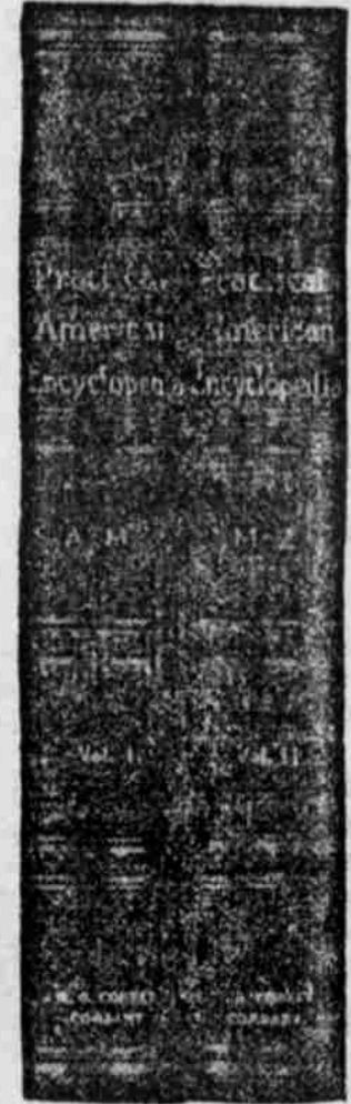
Both Sets have the SAME NUMBER OF PAGES AND SAME SIZE OF TYPE, but new methods of bookmaking and the use of thin Bible paper have made the convenient volumes possible.

Are Contained in These Two Convenient, Flexible, Handy Volumes