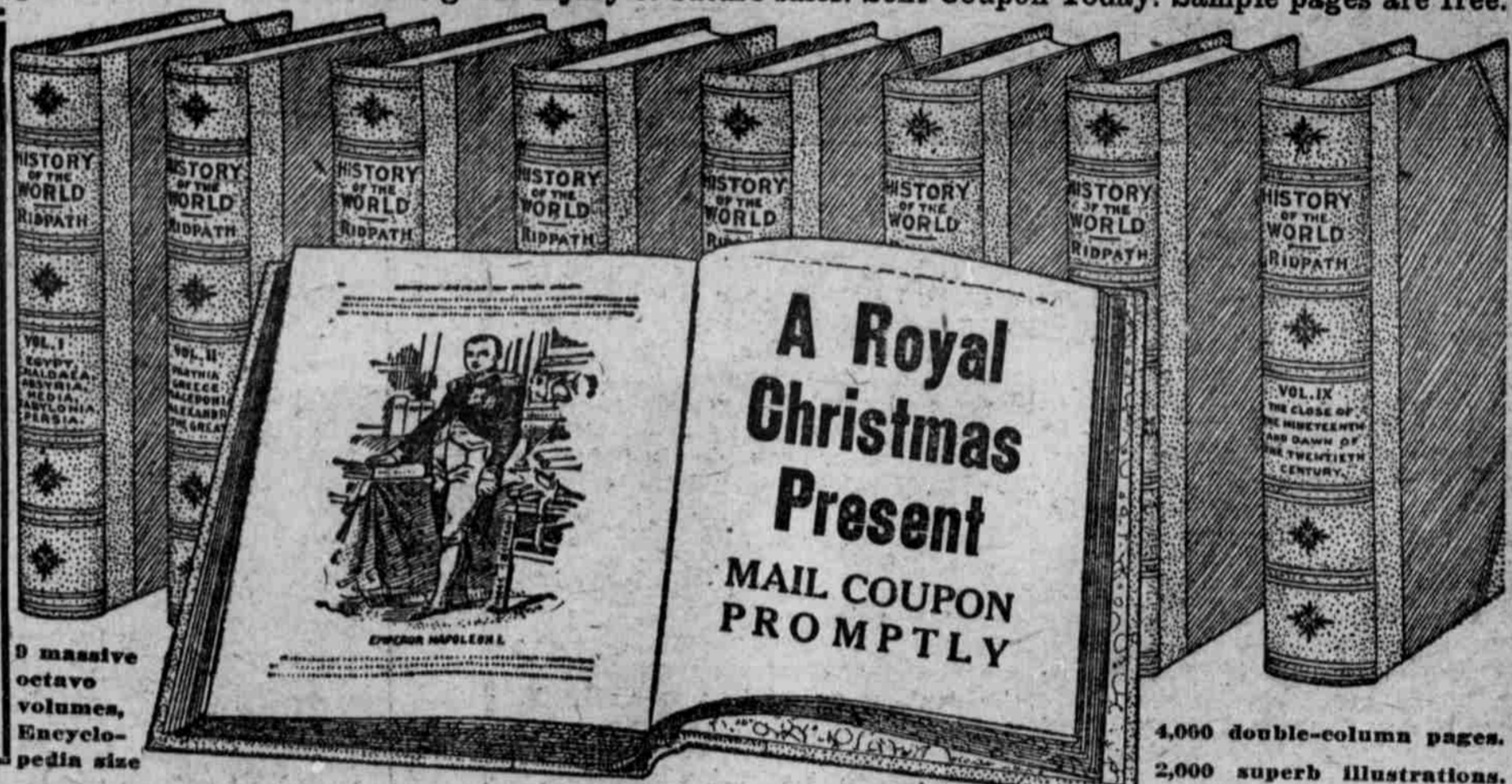
9 massive octavo volumes, Encyclopedia size

Have purchased this great history in the past twenty years at double our special price and every purchaser is a staunch friend. This means that practically as many Americans have bought Ridpath as have bought the great Encyclopedia Britannica and the Century Dictionary combined. Can you imagine any greater testimonial for any book? Dr. Ridpath's Immortal Work commands the admiration of the English-speaking world. It is endorsed by the scholarship of the world, and by the great American people as the only history of the world worth having. Ridpath was a strong advocate of the rights and liberties of the common people. In 1896 he was the democratic nominee for congress in his home district and received the warm support of the leader of the party. Dr. Ridpath is dead but his work lives. He devoted his entire life to writing the History of the World. It is absolutely accurate and impartial, and commands the admiration of the English-speaking world.