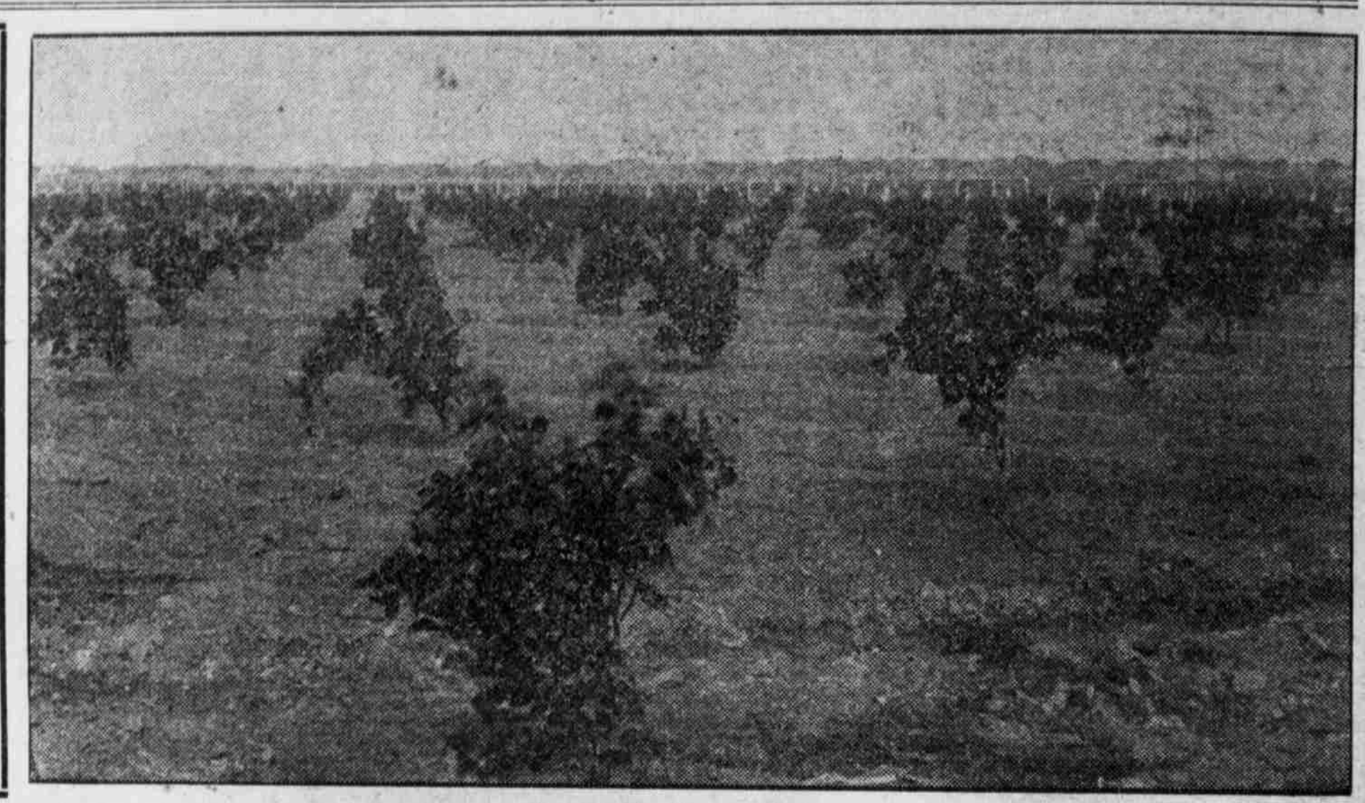
San Benito Orange Grove