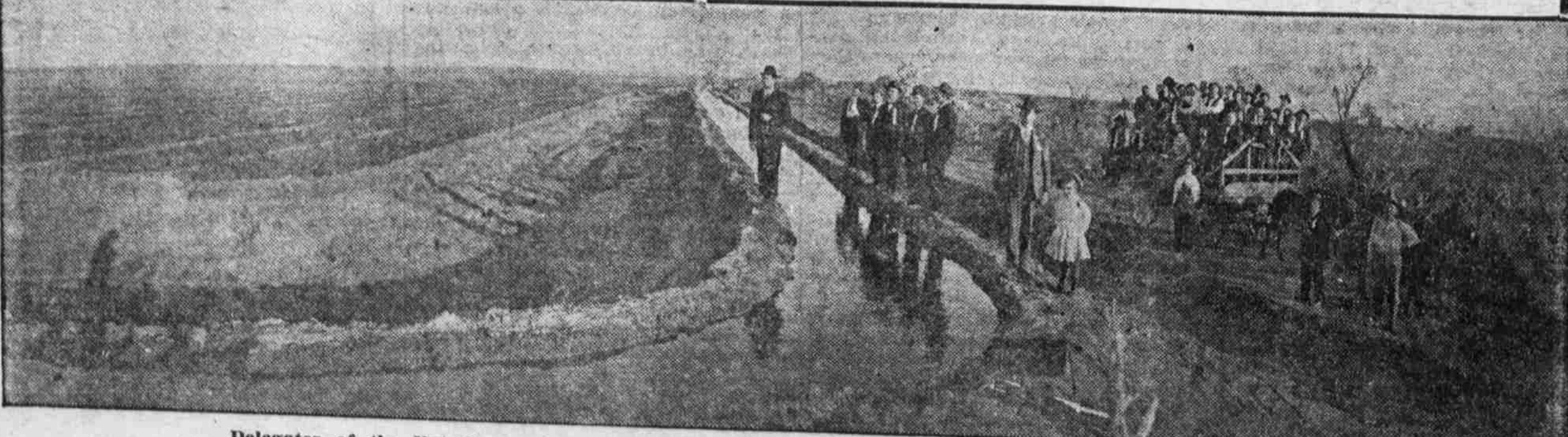
Delegates of the Nut Growers' Convention Viewing Canals and Crops at La Lomita Ranch. Mission. Texas