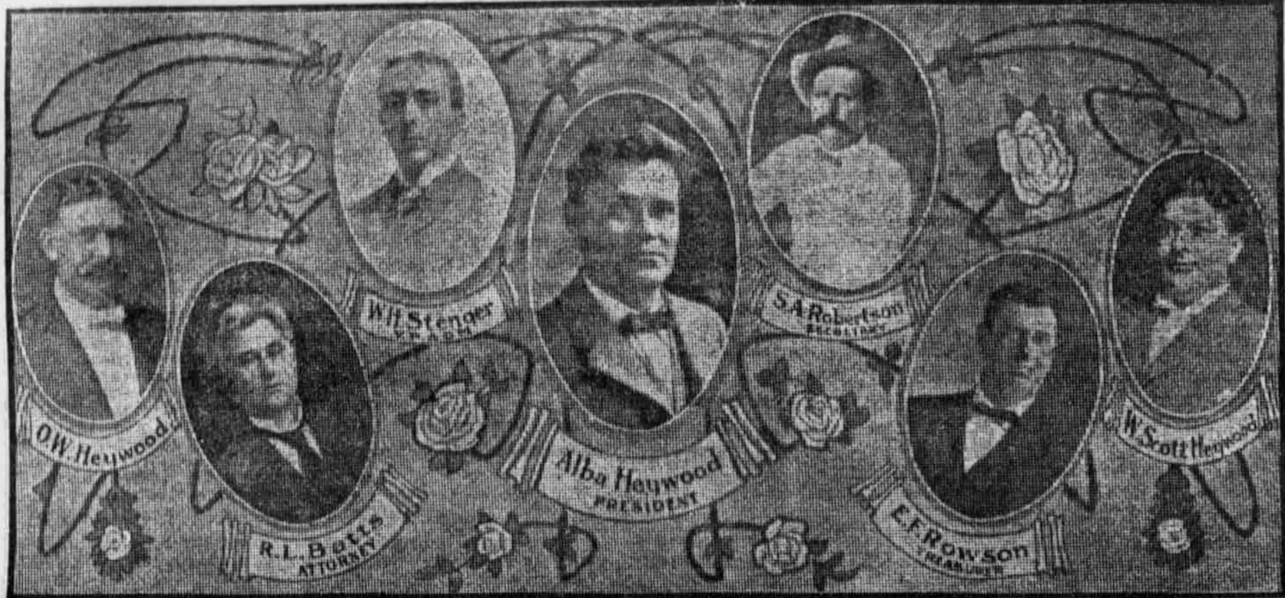
The Officers and Directors of the San Benito Land & Water Company.

As a popular magazine writer has said: "One American harvest will buy the kingdom of Belgium, King and all. Two would buy Italy. Three would