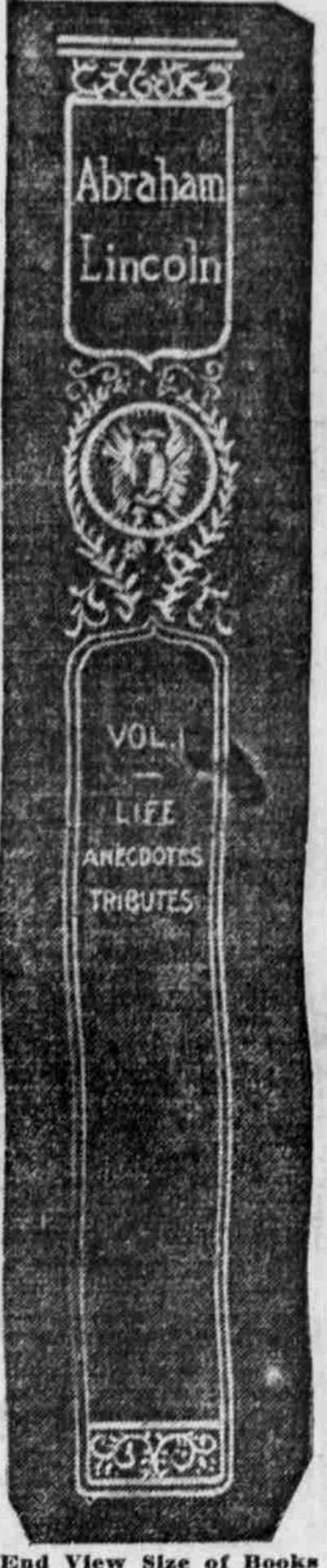
End View Size of Books

Secure and send in your subscription lists at once, and state what book or books you desire sent to you. Your own name may be included in any list, and a renewal subscription will count the same as a new one. Any boy or girl can take advantage of this offer. Make remittance by post-office money order and address THE COMMONER, Lincoln, Neb.