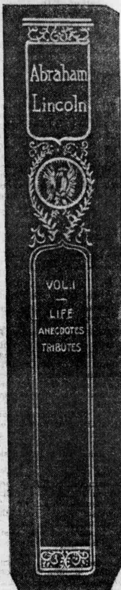
Cut Shows Size of Volumes, end view.