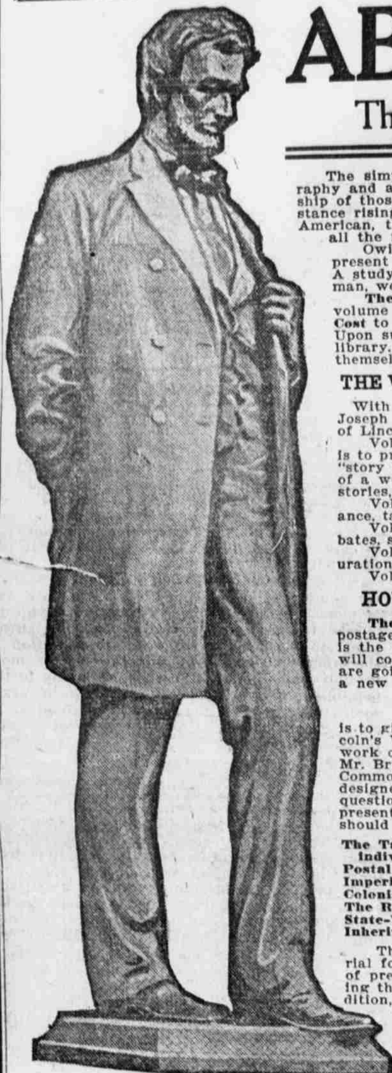
From a Photograph of the portrait Statue by Augustus St. Gaudens, Lincoln Park, Chicago

The Most Interesting American of the Nineteenth Century