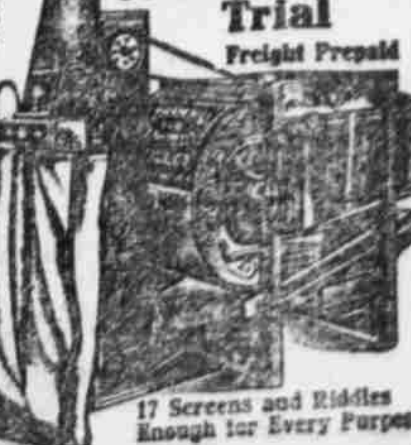
圖 30 Days Free

We have 26 Branch Warehouses, and make prompt shipments