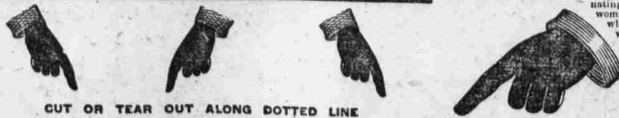
CUT OR TEAR OUT ALONG DOTTED LINE