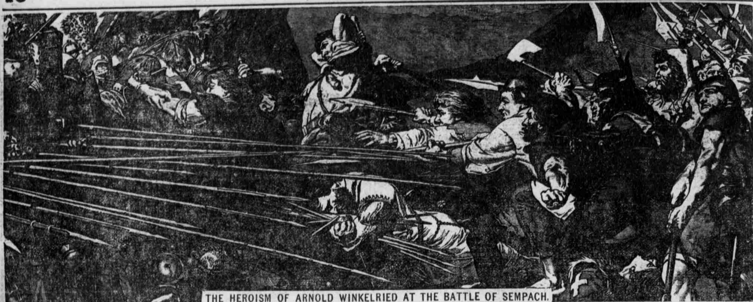
THE HEROISM OF ARNOLD WINKELRIED AT THE BATTLE OF SEMPACH.

ARNOLD WINKELRIED'S heroic sacrifice achieved the independence of Switzerland. "Make way for liberty he cried, make way for liberty and died" is the poet's commemoration familiar to every school boy and girl in the land. The famous picture shown herewith from Ridpath's History is but one out of 2,000 in the complete work and serves to illustrate but one event out of all the thousands which make up the world famed publication.