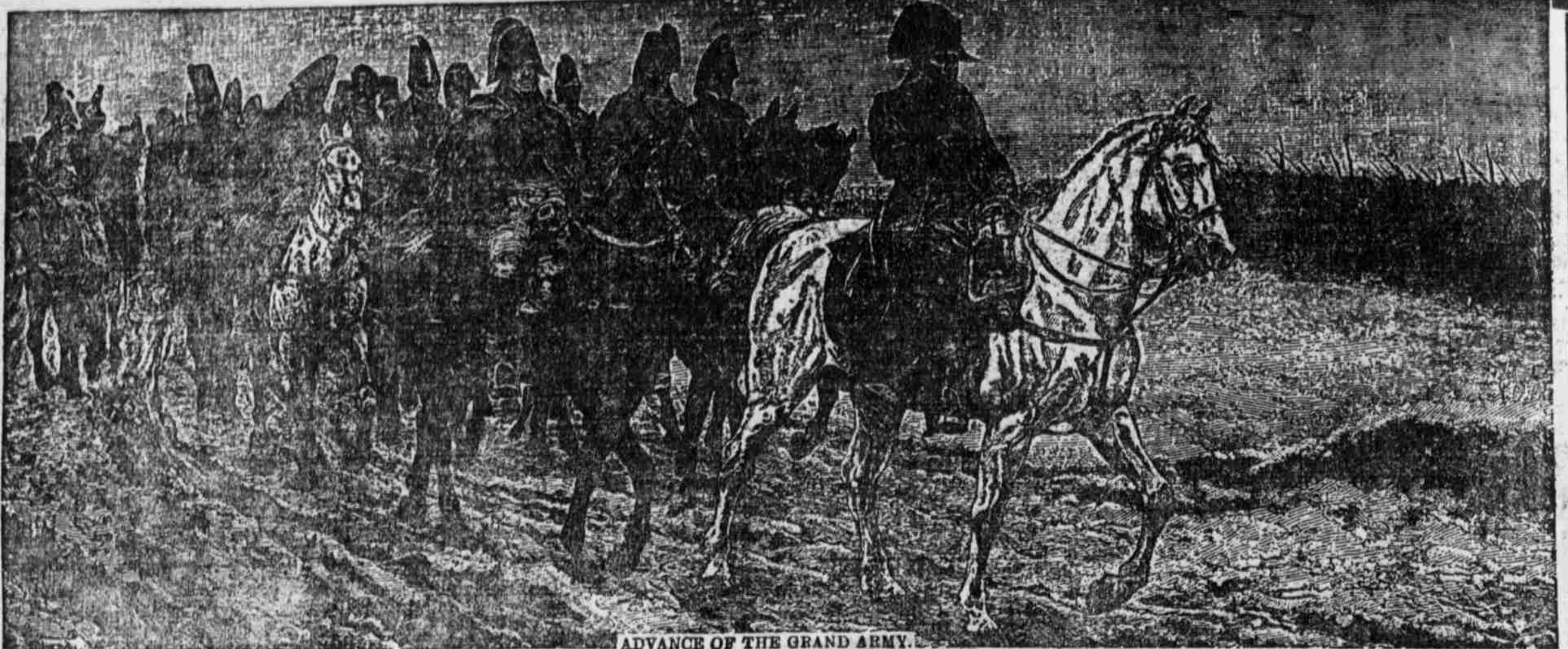
ADVANCE OF THE GRAND ARMY.

N APOLEON'S name fills more pages in the world's solemn history than that of any other mortal. The advance of his Grand Army into Russia is the turning point in his career and marks the beginning of his downfall. The picture shown herewith from Ridpath's history, the original of which was displayed at the World's Fair at Chicago, marks but one event out of thousands which are fully described and illustrated in the world-famed publication.