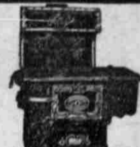
Kalamazoo Royal Steel Range, one of many styles—exceptionally economical of fuel.

KALAMAZOO STOVE COMPANY, Manufacturers, Kalamazoo, Michigan. Original "Direct-to-user" Manufacturer. Beware of imitators.