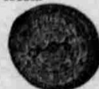
All our cook stoves and ranges are equipped with patent oven thermometer, which saves fuel and makes baking and roasting easy.