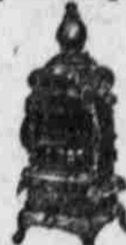
Kalamazoo Radiant Base-Burner. Positively the best bargain ever offered in a heating stove.