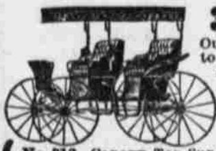
No. 313, Canopy Top Surrey with Automobile Style Seats. Price, $73.50.

Elkhart Carriage & Harness Mfg. Co., Elkhart, Indiana