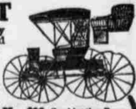
No. 680, Combination Buggy and Driving Wagon. Price complete, extra seat, $53.50.