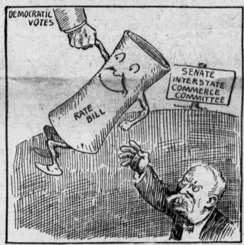
-- Rescued from a Hostile Committee by Democratic votes--