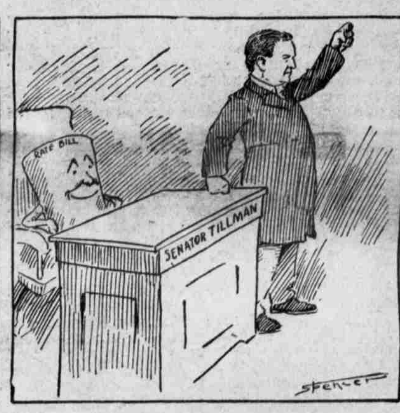
and officially championed by a Democratic Senator?