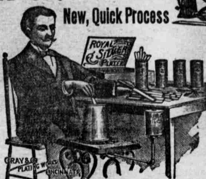
ROYAL SILVER OUTFIT IN OPERATION.