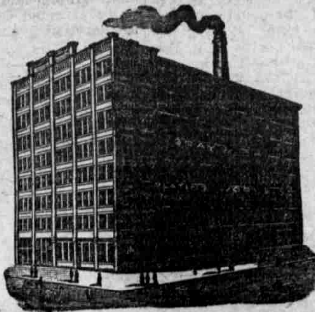
Factory and Warehouse of Gray & Co., Cincinnati, O. Capital $100,000. Employ 200 to 300 people daily.

The more new thinly plated goods sold the greater will be the demand for plating. Plate some articles for your friends and neighbors by Professor Gray's Process, and it quickly proves to them its genuineness and merit and