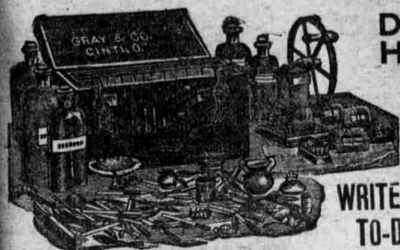
TRAVELING OUTFIT FOR GOLD, SILVER AND NICKEL PLATING.

LET US START YOU WRITE TO-DAY. BIG PROFITS.