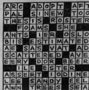
(SOLUTION TO LAST WEEK'S PUZZLE)