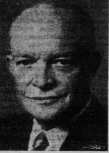
DWIGHT D. EISENHOWER

presidential and a vice presi- (Con't on Page 2, Cols. 4 and 5)