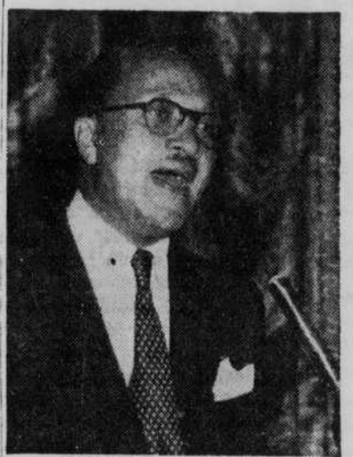
EARL B. DICKERSON

Widely known Chicago attorney who has just been elected president of the National Lawyers Guild. Composed principally of white lawyers, among them some of the nation's most outstanding legal minds, this is the first time a Negro has been named head of the organization. Atty. Dickerson, who is general counsel for the Supreme Liberty Life Insurance company of Chicago, is also president of the Chicago branch of the National Lawyers Guild.—(ANP)