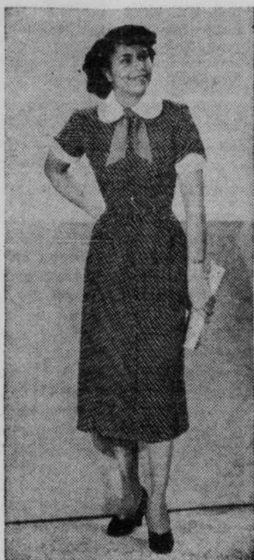
ON THE DOT of fashion is this polka-dotted favorite in black and white rayon crepe with white pique "boy" collar and cuffs and a bright red tie. (ANP)