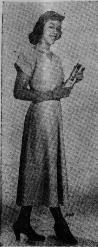
BEAUTIFUL iridescent shantung sculptured into a delicately simple frock with a daringly carved neckline, it can be worn anywhere, accessorized for any occasion. Sold in homes.