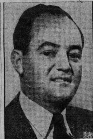
SENATOR HUMPHREY.

According to Walter White, the association now has a membership of nearly 500,000 in 1,551 active branches in 45 states, the District of Columbia and Hawaii.