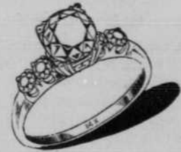
DIAMONDS ENLARGED TO SHOW DETAIL