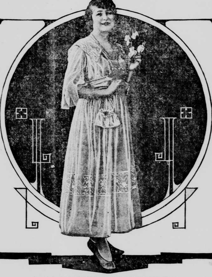
COMMENCEMENT GOWN OF WHITE NET

and it arrives at distinction when the fabric, or of both combined, is all right