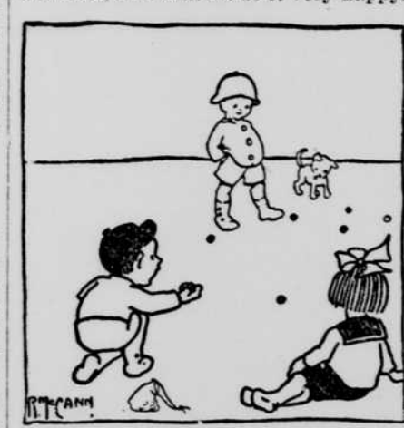
They Played and They Played.

but then the Master told the other low in the neck in front, where lace is merely as a street hat.