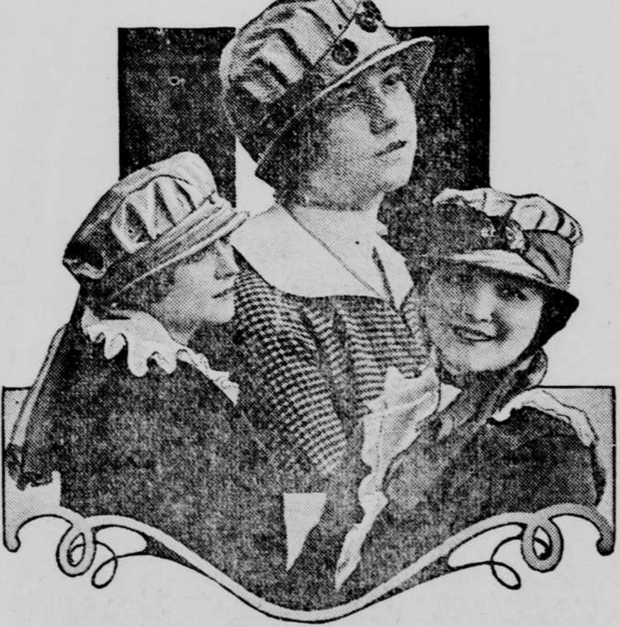
LAST CHAPTER IN STORY OF MOTOR HATS

rosettes at the back instead of a bow Gray, tan, castor and blue in medium or sash ends. But in this matter let shades are favorite colors for motor each individual suit herself as well as wear. There is a fad for vivid yel-