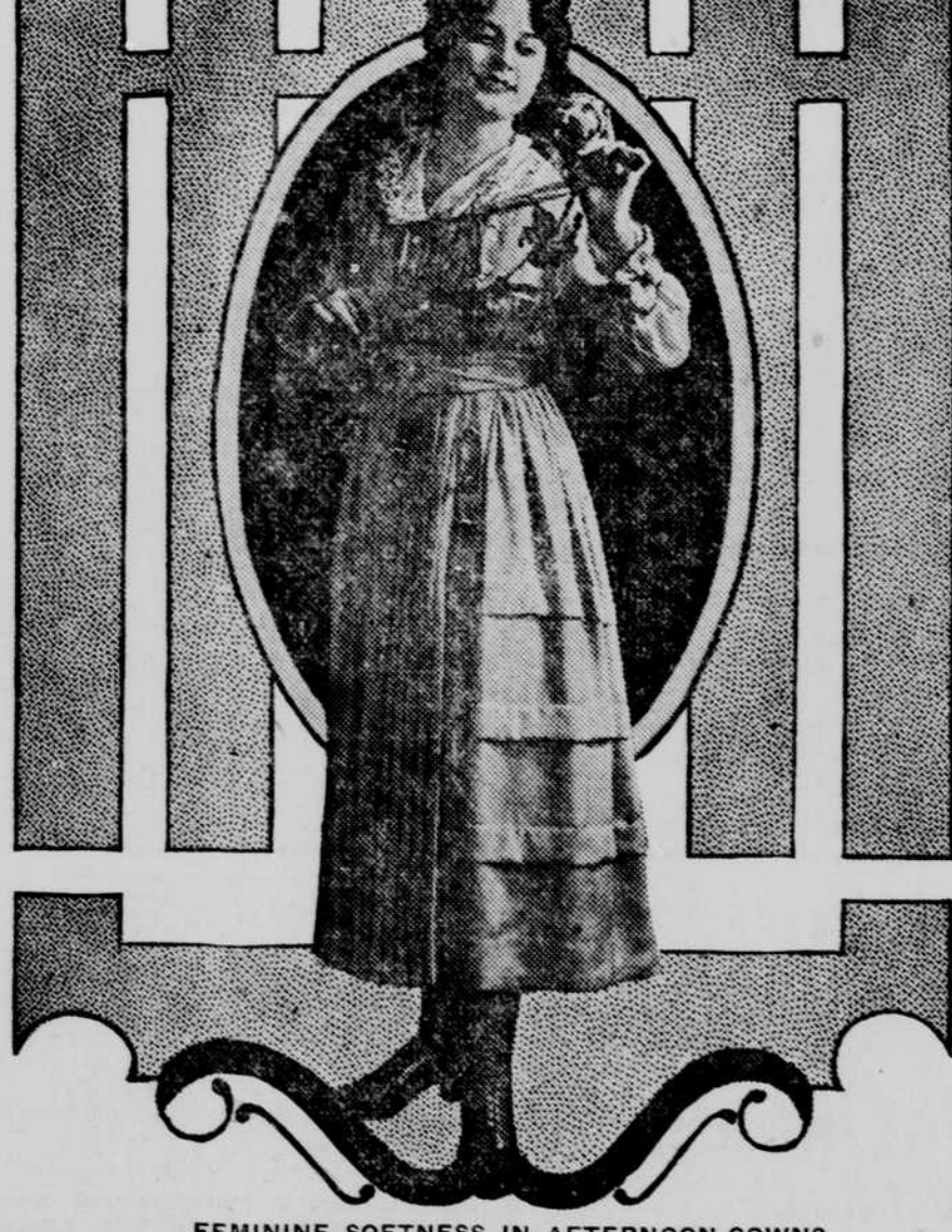
FEMININE SOFTNESS IN AFTERNOON GOWNS

finished at the top with a border and Besides these sheer gowns there are suspenders of crepe georgette and at others of soft silk crepe, or light woolthe bottom with little silk balls. The en fabrics, that are of the same character. One of them is shown in the Among new models in net there are illustration, and it might be made of some having underpetticoats of net and crepe de chine, challies, satin, silk-andcrepe instead of silk, and the effect is wool poplin or any other supple mawonderfully soft. Net in two colors, terial. It is a one-piece dress with hemstitched together, provides some lengthwise plaits down the front and that way,' said Pinky, 'in any case, be- novel effects in draperies and a favor- three wide tucks in the remainder of cause my mother isn't small with wings | ite combination is paprika, or tomato | the straight, full skirt. The sleeves like a Hen. She's a great big, fat, red. and white. The dress pictured is are full and gathered into a frill at the