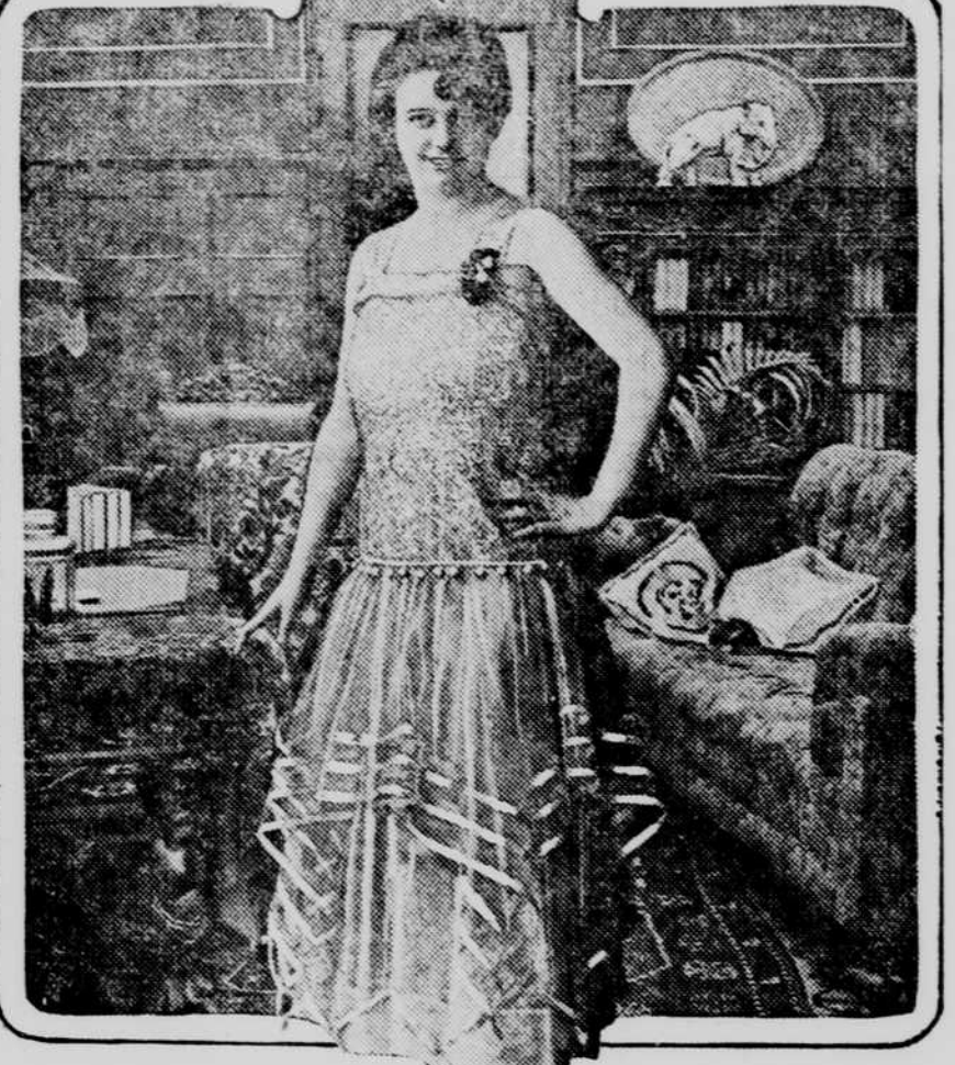
NET A FAVORITE IN PARTY FROCKS

The pretty dance frock shown in the The pretty lingerie dress has repicture has a double skirt of net, one turned in all its glory of fine lace and of them finished in points about the fine handwork on fine materials. Sheer bottom, bound with narrow satin rib- cotton and linen fabrics, and laces, bon. Over this a second skirt of net, dear to the hearts of fine ladies, are finished with a border of three rows put together with painstaking needle-