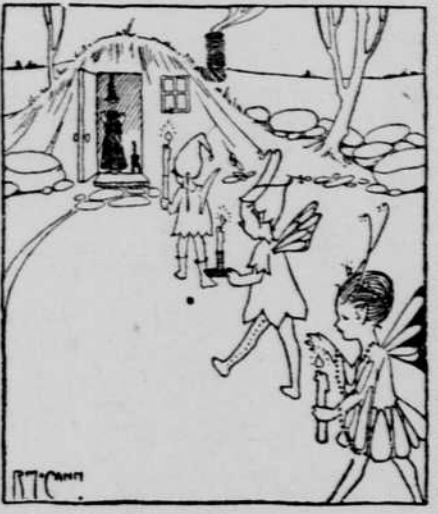
How Surprised Witty Witch Was.

"But how surprised Witty Witch was when she saw her guests. She got