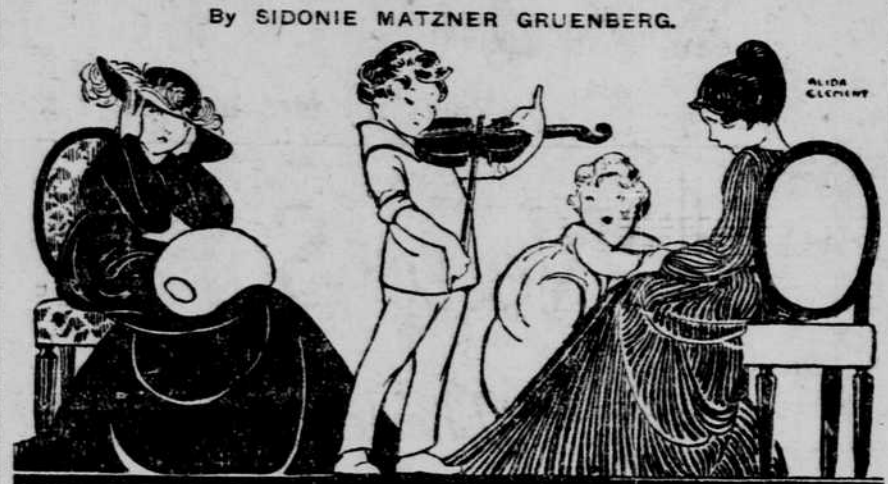
No Environment Can Develop Qualities That Are Not There.

No Amount of Training or Environment Can Create It, but a Child's Natural Talents May Be Developed by Cultivation.