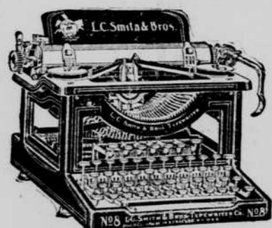
Ball Bearing Long Wearing

—Model 8 shows what should now be expected of a typewriter.