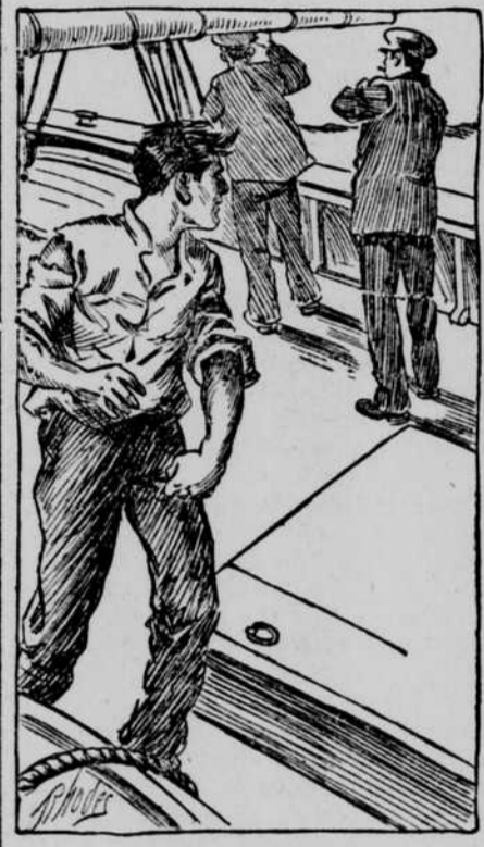
I Have Seen Him Follow Wolf Larsen About With His Eyes.

I often wondered why Wolf Larsen did not kill him and make an end of it. But he only laughed and said: