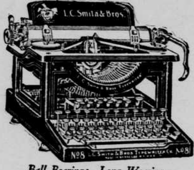
Ball Bearing Long Wearing

—Model 8 shows what should now be expected of a typewriter.