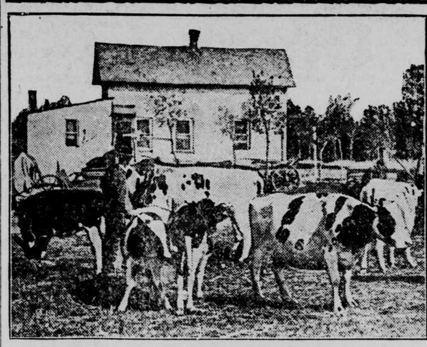
A Fine, Healthy Herd of Dairy Cows.