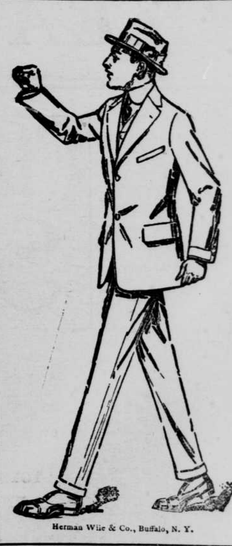
Herman Wise & Co., Buffalo, N. Y.