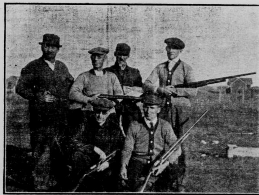
THE LOUP CITY GUN CLUB.