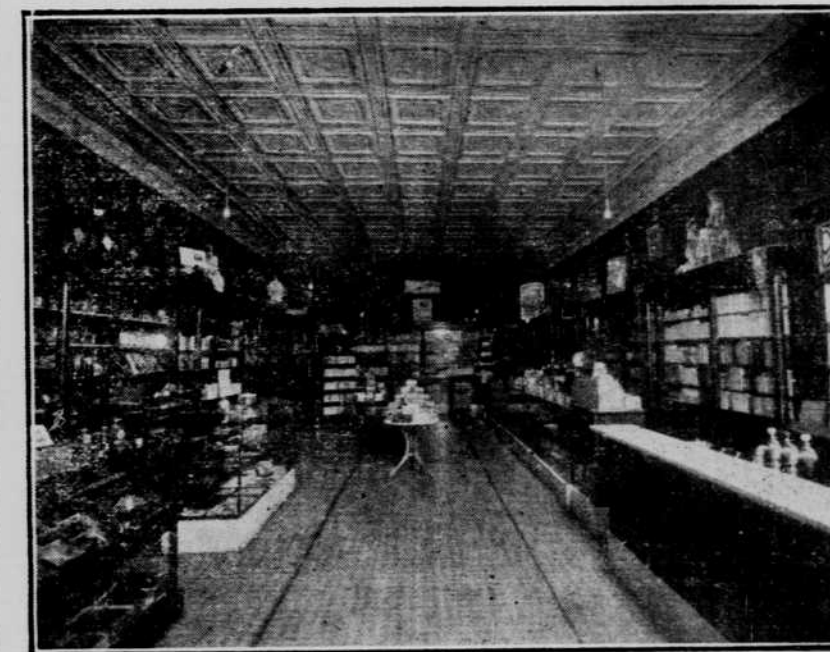
INTERIOR OF THE REXALL STORE.