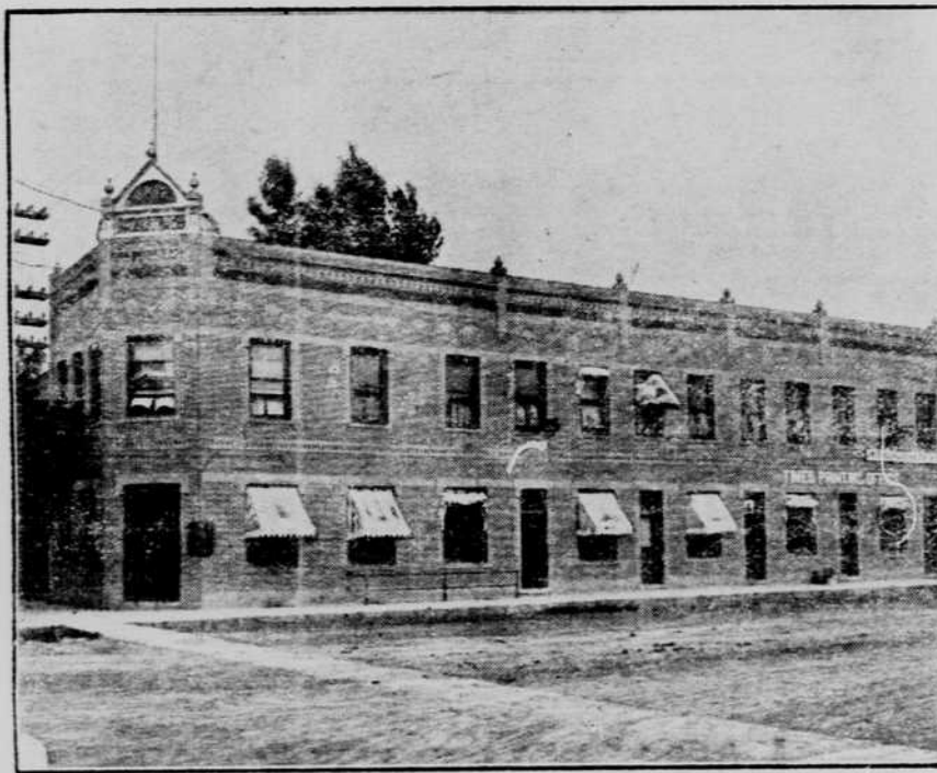
LOUP CITY STATE BANK BUILDING.