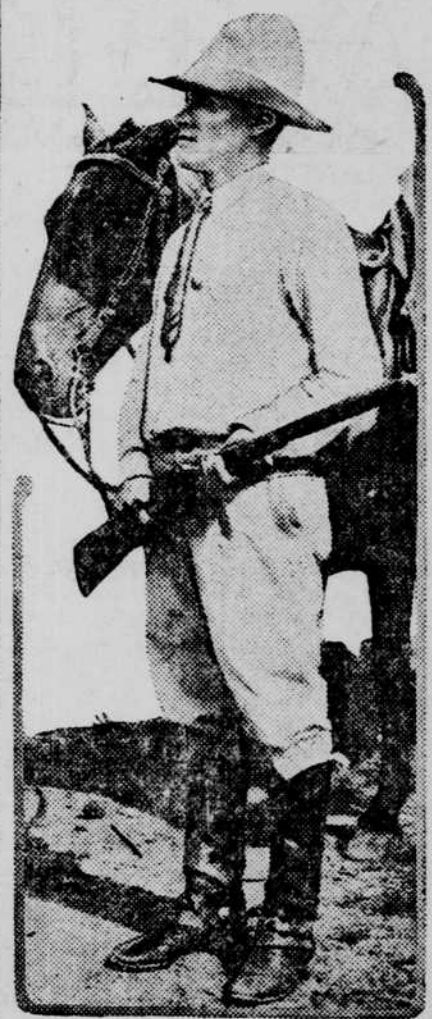
This is one of the Texas Rangers who have been so active in combating the Mexican bandits that have been making raids across the border.

Yankee Ingenuity. An American inventor has contrived an aluminum framework which, on being fastened over a bolt of cloth, shows the effect of a finished suit of clothes. The wire frame carries outlines of arms, lapels, collar, etc., and molds the cloth to the proper shape without injuring it in the least. The frame may readily be detached and tried on another piece of cloth until the customer's fancy is suited.