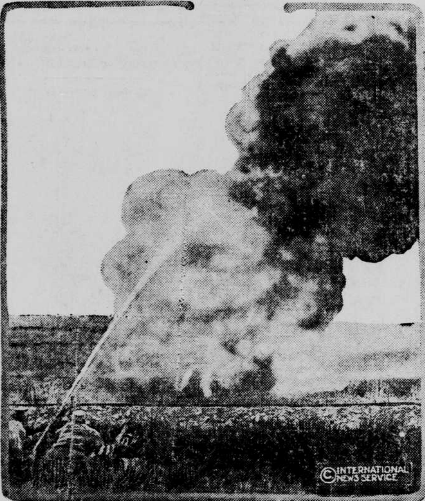
This photograph, taken recently "somewhere in France," shows how the French have taken a lesson from the Germans and have adopted the frightful liquid fire as a weapon of defense.