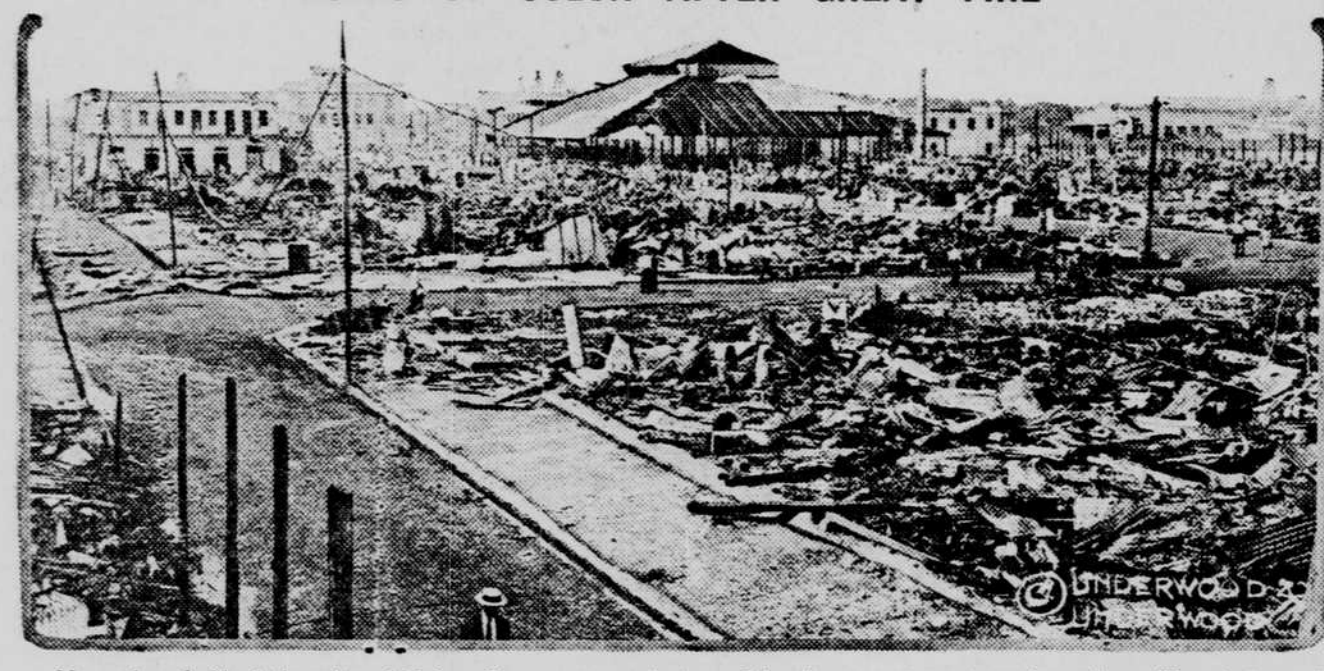
than half of the city of Colon, Panama, was destroyed by the recent great confiagration. The photograph gives a view of the ruins from Holivar street, looking toward Cristobal. The ruins of the market are seen in the