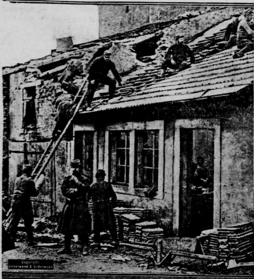
French soldiers near Arras helping the inhabitants repair their ruined homes so that they will be fit to live in. The houses were wrecked by German shells.