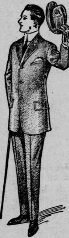
Three-Button Regular Sack, No. 813