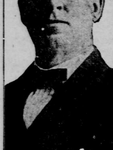
GOVERNOR J. H. MOREHEAD Renominated by Democrats.

Receipts of practically complete returns from Lancaster county are a principal factor in the latter feature.