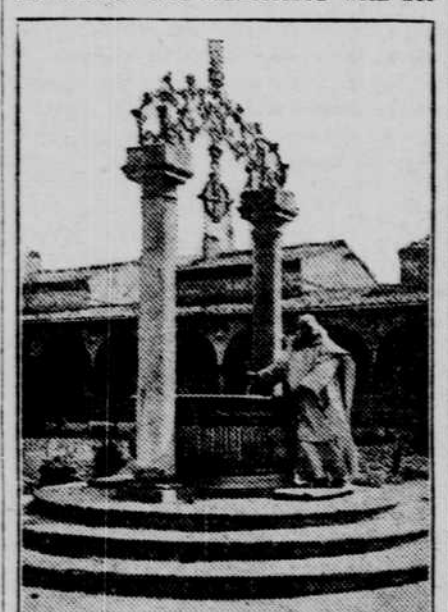
Public Fountain at Florence.

Easter Monday is the special festirious villages of the district offerings have proven that it requires propor- year. of oil for the lamps of her shrine are children dressed as angels, riding there are more idle days during the der, either singly or in pairs, except richly decked donkeys, and accompanied by priests, acolytes and the people in their holiday attire. These of for good horses from the cities that are held one or two days each week