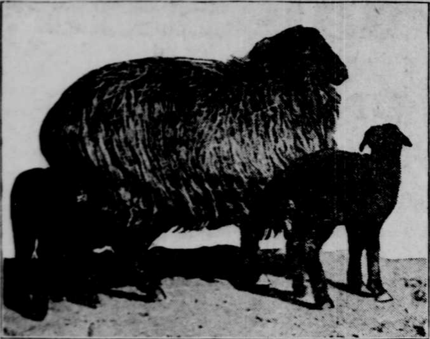
Karakule Ewe and Twin Lambs.