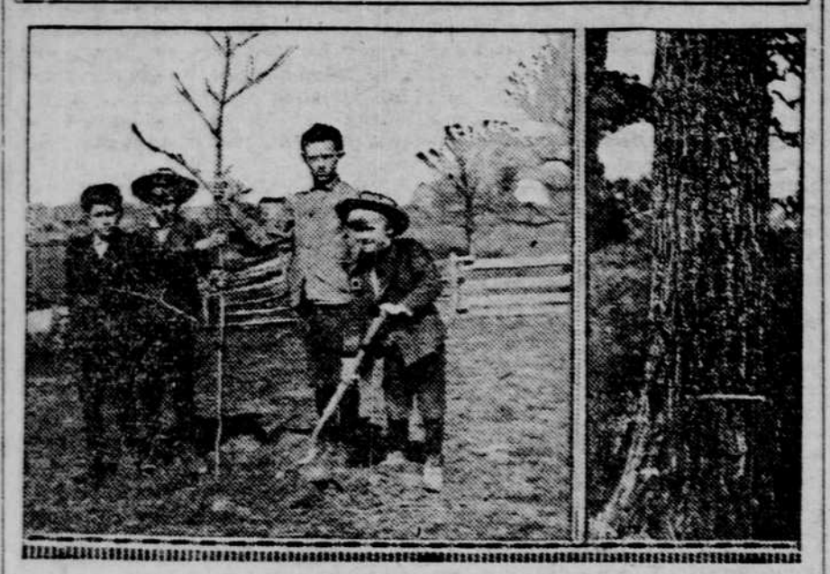
This Tree, and It Will Grow as They